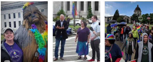
Photos taken from Pride month 2018